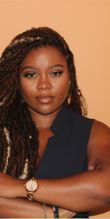
Groups are facilitated by a state licensed and nationally certified LCSW and PhD

The FLY Support Group is just for women!